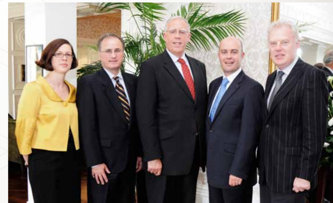
RASLRES International Launch, Sept 7th 2010 Bunratty

During 2010 the Assembly organised a number of Project Management events to assist Irish Partner organisations in the implementation of projects. Details of these events are set out in the section ‘Joint co-operation initiatives with the SEUPB’. Presentations on Transnational Interreg Programmes were also delivered to the Environmental Research Institute at University College Cork (June), University of Limerick, (July) and the Northern Ireland Local Government Association (October 2010).