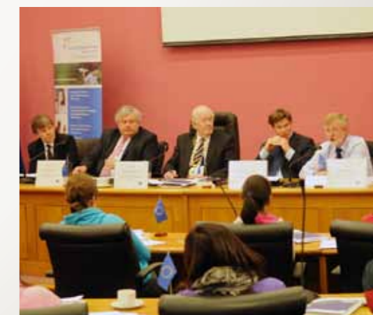
bottom right: TalktoEU Seminar