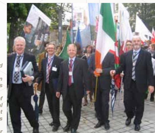
bottom left: Presentation of Declaration of the Regional Competitiveness and Employment Regions