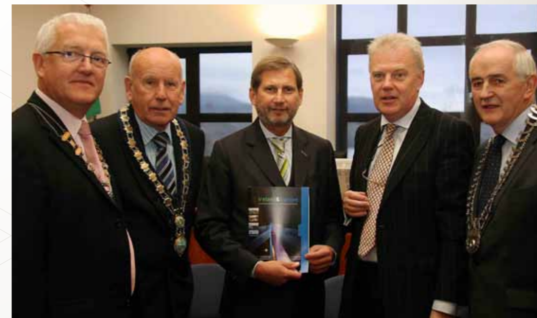
Visit by Commissioner Hahn to European Association of Border Regions Annual Conference, October 2010

As the Contact Point in Ireland for the Interreg IVC Programme, the Assembly in 2010 continued in its work with the Programme Managing Authority in Lille, France and the 25 Irish partners participating in 17 approved projects with other regions from throughout the EU 27 member states. To date, the total benefit to Ireland from the programme has been €3.4m in ERDF. A wide range of thematic areas are being explored in these projects including Youth Entrepreneurship, Sustainable Transport, inland waterways development and addressing declining rural populations. A broad mix of Irish partner organisations’ are represented in these projects for example the South East Regional Authority, Shannon Development, WESTBIC and University College Cork.