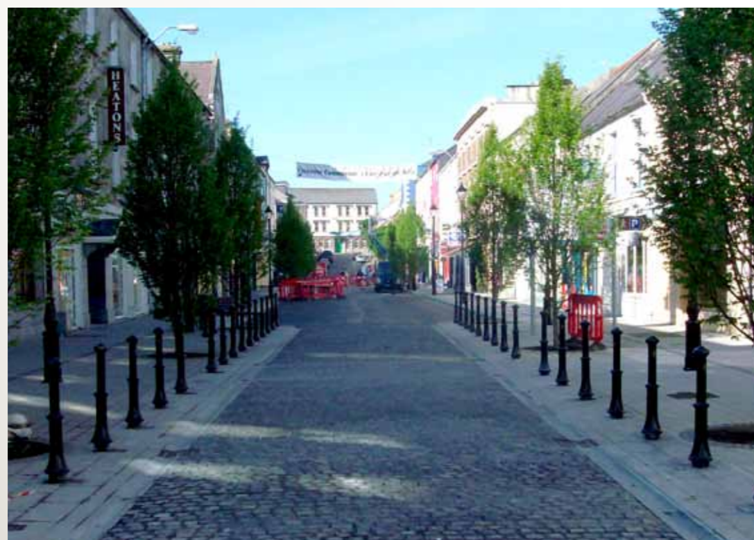
Ballina Gateway & Hub Project

During 2010 the Managing Authority closely monitored the level of expenditure and commitments in respect of all EU co-financed themes and also co-operated fully in the Mid-Term (Performance) evaluation of the OP conducted by the Central Expenditure Evaluation Unit. Notwithstanding the difficulties imposed by the current economic and fiscal situation, good progress has been made in the implementation of the majority of the co-financed themes, with full completion of works under both the key linking routes and natural heritage themes. Implementation has commenced on aspects of all four priorities