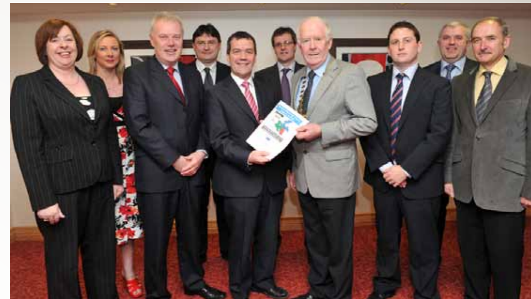
BMW Regional Assembly Presents Airports Report to Minister Noel Dempsey

The BMW Regional Assembly in conjunction with Ms. Marin Harkin MEP and member of the Globalisation Fund working Group engaged in meetings and discussion with the Department of Enterprise, Trade and Employment in relation to initiating the development of a new application from Ireland to the European Globalisation Fund (EGF). The EGF supports workers who lose their jobs as a result of the changing global trade patterns so that they can find a job as quickly as possible. Through consultation and analysis of available data, a new application was submitted to the fund for consideration for those who had lost their jobs in the construction industry in Ireland. A funding package was sought for 8,763 workers.