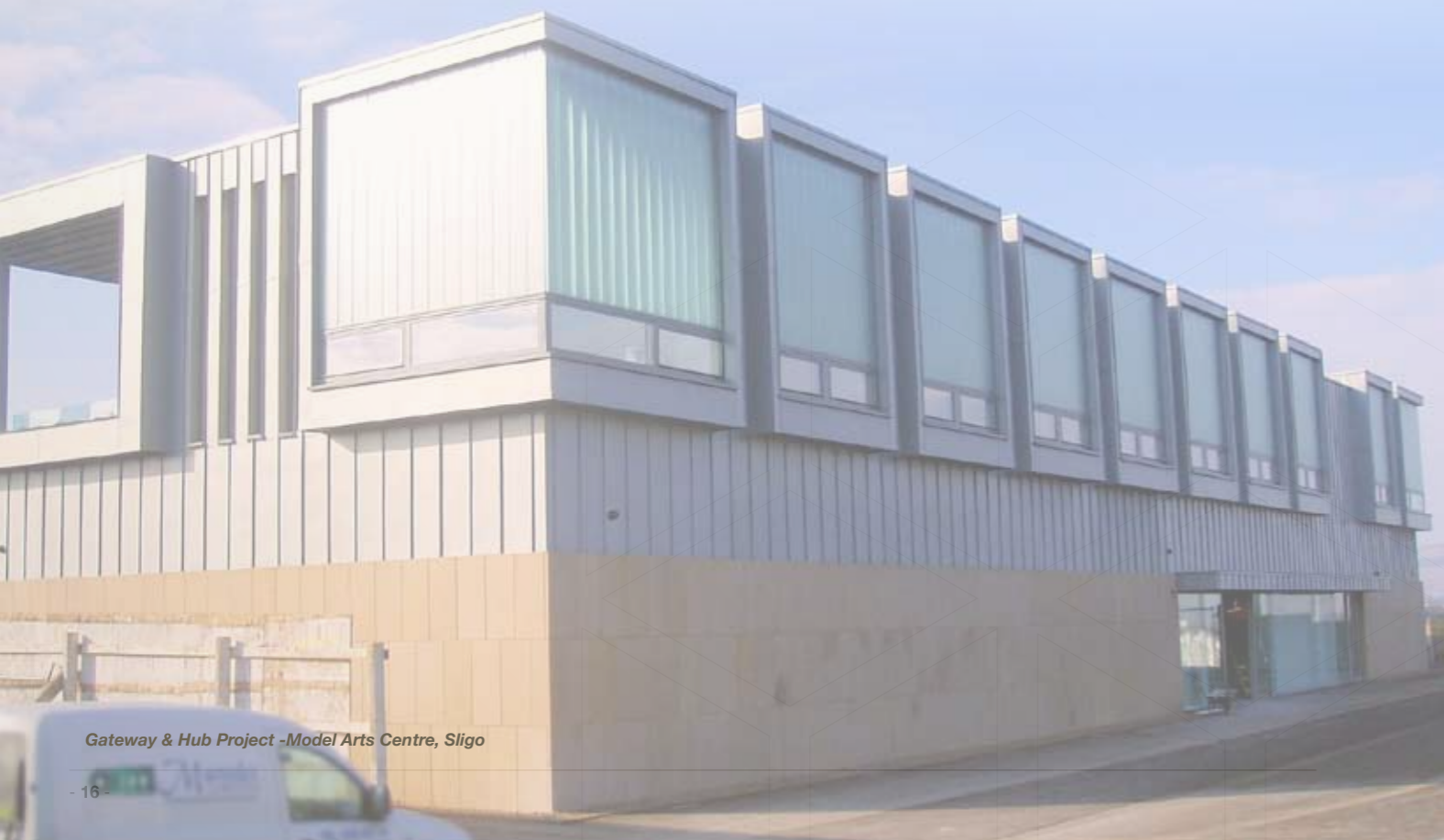
Gateway & Hub Project - Model Arts Centre, Sligo