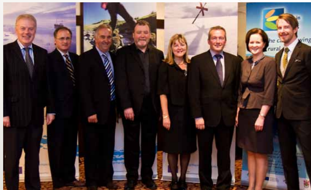
NPP Annual Conference 2010, Bunratty