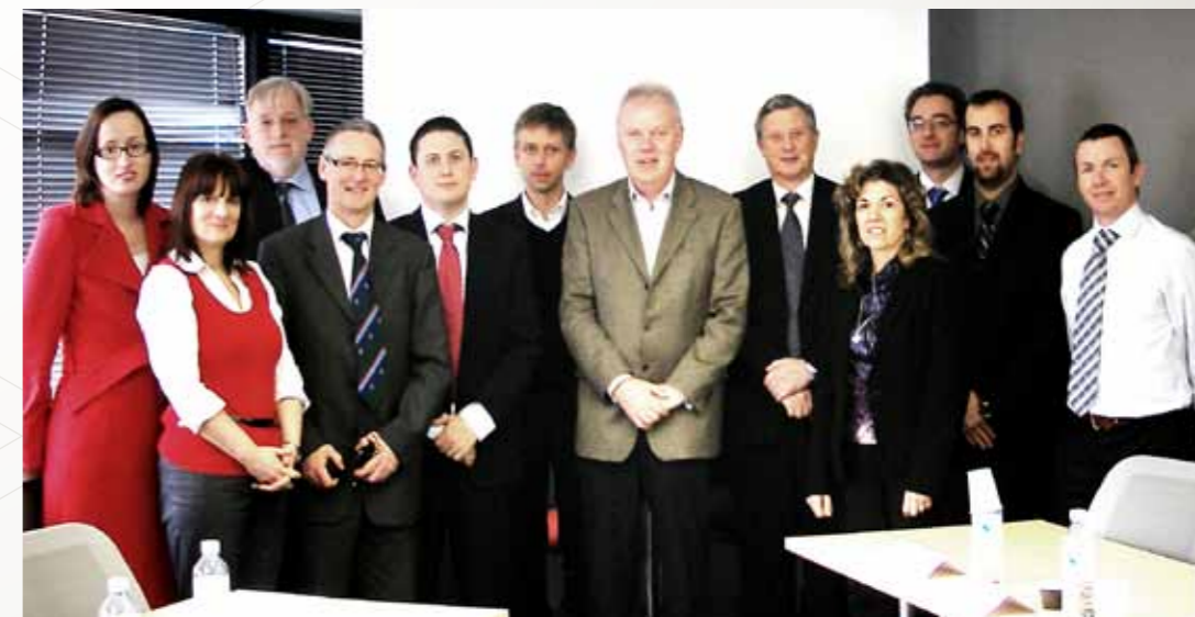
AtlantKIS Partner Meeting Rennes March 2010

All policy and research publications are available at the Policy and Research Section of The BMW Regional Assembly website - www.bmwassembly.ie