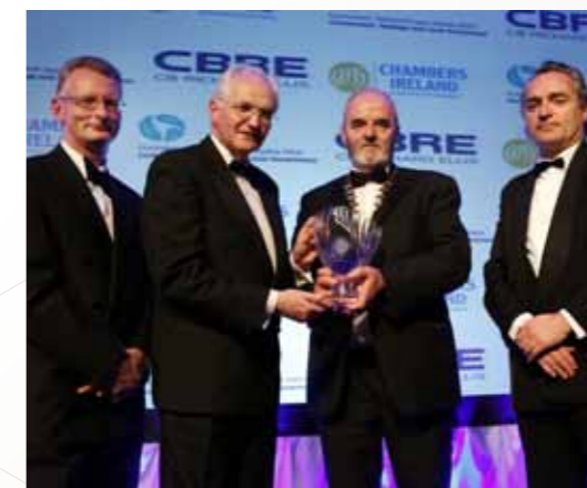
top left: Chambers Ireland Award