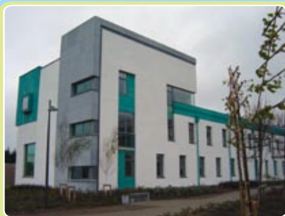
Regional Incubation Centres help nurture young companies

A range of business development support is available for client companies, such as financial, legal, sales, marketing and export development, including mentoring and networking facilities. Six projects (total capital grant value of €13.8 million, with an EU contribution of €10.4 million) were up and running by the end of 2007, with 54 enterprises in place, employing a total of 175 employees. Of the 54 enterprises, 22 are engaged in collaborative innovation or commercialisation activities with their host institution. One such incubation centre is the Innovation in Business Centre (IIBC) at the Galway-Mayo Institute of Technology (GMIT), which supports the development of new enterprises in the region by providing incubation space and business development support for the nurturing of new ideas and the commercialisation of applied research. It offers incubation facilities and a supportive environment to potential entrepreneurs to assist them in taking their ideas from concept to full commercialisation.