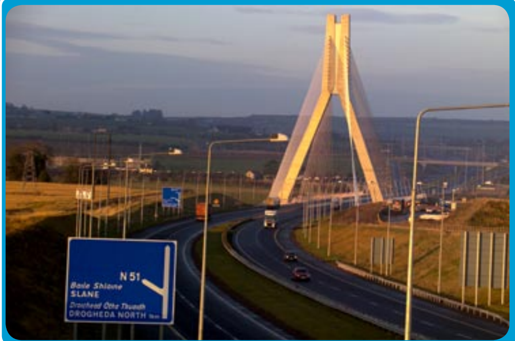
Ireland participates in 3 cross-border, 3 transnational and all 4 interregional co-operation programmes